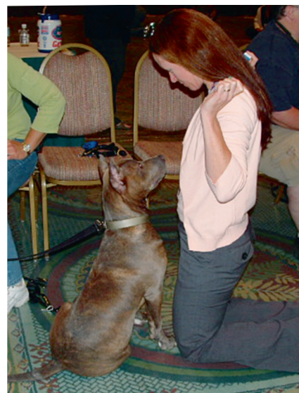
Teaching “sit” and “look” to a dog in laboratory class. Notice that the human moved closer and lower (by kneeling) to this dog to keep the dog focused on her. The dog is about to be given a treat which is enclosed in the human’s left hand (a clicker is in the right hand).

“Bonnie—sit—(3-second pause)—sit—(3-second pause)—Bonnie, sit, look—(move closer to dog and move treat to your eye to encourage her to track the treat to your eye and “look”)—sit—good girl! (treat)—stay—good girl—stay (take a step backward while saying “stay”—then stop)—stay Bonnie—good girl—stay (return while saying “stay”—then stop)—stay Bonnie—good girl (treat)—okay (the releaser and she can get up!)”